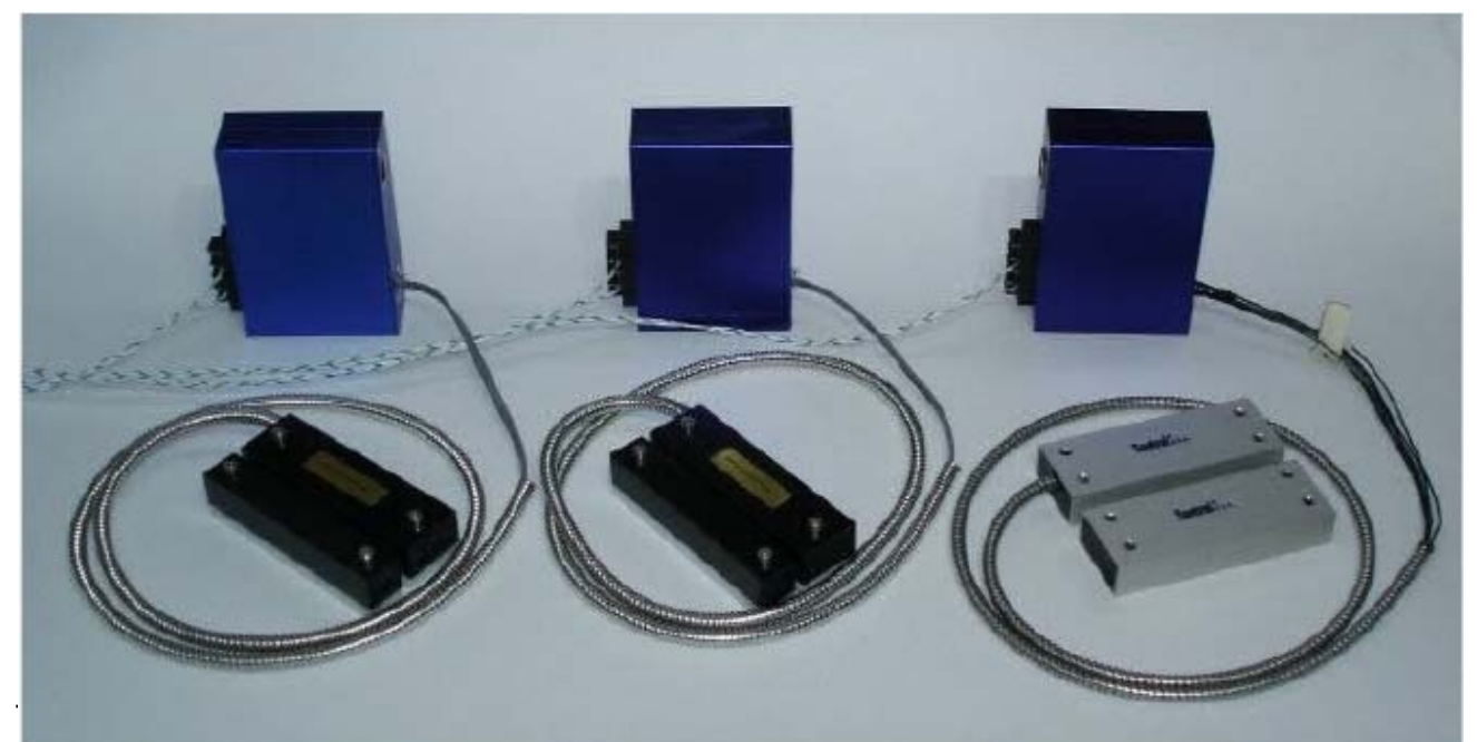
conventional wired system. Remote test terminals are available on the partier strip.